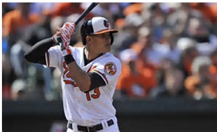
The most meaningful multi-HR game of the season was the Otters 15-2 playoff win over the Devils. Daniel Murphy (left) and Manny Machado (right) both hit a pair of home runs in the lopsided Otters playoff victory.

The biggest outburst of the Devils season saw the top eight spots in the batting order rip 24 hits against the Whatever's . Each of the hitters had at least two hits. The ninth slot in the order did not record a hit, but had a sac fly.