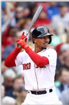
Devils RF Mookie Betts hit two homers in the Series, both off Otters ace Jose Fernandez.