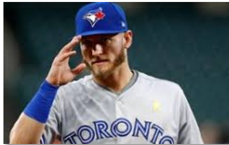
Devils 3b Josh Donaldson homered twice in the Fall Classic, winning Game Two 1-0 with a 12 th inning homer off Otters reliever Shawn Kelley.