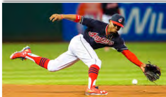
What SS Francisco Lindor came into his own in 2018, anchoring the Whatever infield with his glove work while showing surprising power. Lindor ranked third in the league in HR (23) while hitting .232 with 47 RBIs, 75 hits and 12 SB.