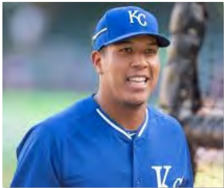
C Salvador Perez won All-Star honors for his glove work and solid offensive performance in 2018.