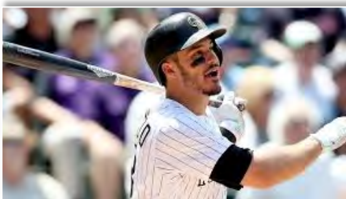
Road Warrior 3b Nolan Arenado excelled at the plate and on defense for the runner-up Roadies in 2018. Arenado hit .258 with 19 HR and drove in 57 runs, tying What RF Giancarlo Stanton for the league lead in runs batted in.