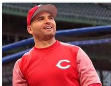
Whatever 1b Joey Votto was the OAPBA MVP in 2018