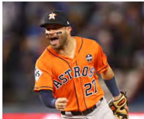
Taz Devil Jose Altuve led the league in stolen bases and edged Beefer Jose Ramirez in All-Star voting at 2b.