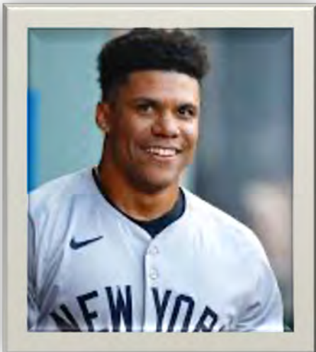
Tsunami OF Juan Soto 2024 OAPBA MVP