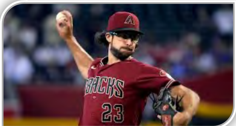
Otter P Zac Gallen 2024 Cy Young winner