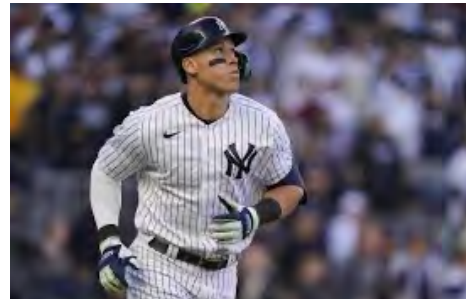
Devils CF Aaron Judge had an outstanding season, ranking second in the league with 26 HRs and fourth in RBIs with 58.