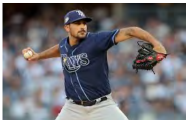
Zach Eflin combined with Adam Ottavino and Jordan Romano to blank the Tsunamis 7-0 in Game Two.

After two quiet innings to begin Game Two, the Otters offense lit up Tsunami starter George Kirby in the third with Manny Machado and Christian Yelich both hitting homers to make it 3-0. In the fourth, the Otters added two more runs on four singles, including RBIs from Manny Machado and Sean Murphy. The Otters increased the lead to 7-0 in the fifth on a two-run homer from DH Ronald Acuña.