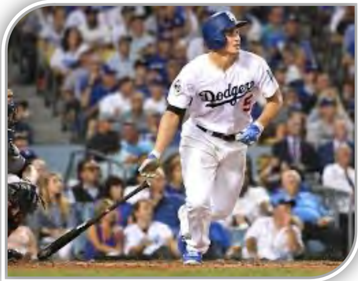
OTTERS SS COREY SEAGER 2024 WORLD SERIES MVP