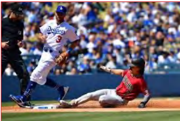
Devils CF Corbin Carroll led OAPBA with 52 stolen bases , the third highest total in league history, exceeded only by Devils Kenny Lofton's total of 67 SB in 1997 and Road Warriors Brett Gardner, who stole 54 SB in 2011.