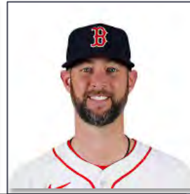
Whatever relievers Jose LeClerc and Chris Martin and second and third among relievers in OAPBA. LeClerc had a 1.53 ERA in middle reliever and Martin had a 1.58 ERA with eight saves.